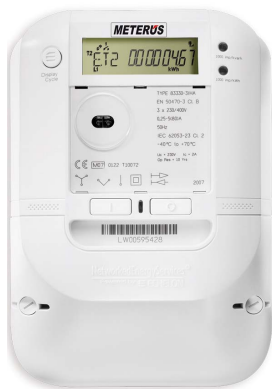
Fig. 2 an actual model of a smart meter [3]

Figure II shows an actual model of a smart meter.