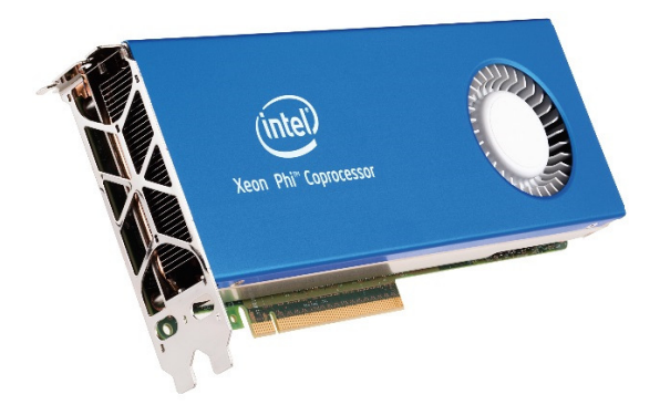
Intel, the Intel logo, the Intel Inside logo, Xeon, and Intel Xeon Phi are trademarks of Intel Corporation in the U.S. and/or other countries. Intel, Xeon, and Intel Xeon Phi are trademarks of Intel Corporation in the U.S. and/or other countries.

Intel® Xeon Phi™ coprocessor cards run a completely independent Linux operating system within the computer. By using multiple cards, users can start parallel jobs, accelerate the most demanding 3D simulations, and keep additional computer resources available for day-to-day work.